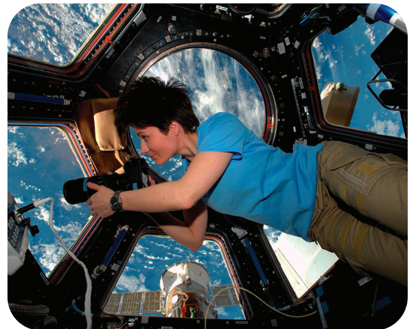
TWO FAMOUS ITALIAN PEOPLE: TIZIANO FERRO (SINGER) E SAMANTHA CRISTOFORETTI (ASTRONAUT)